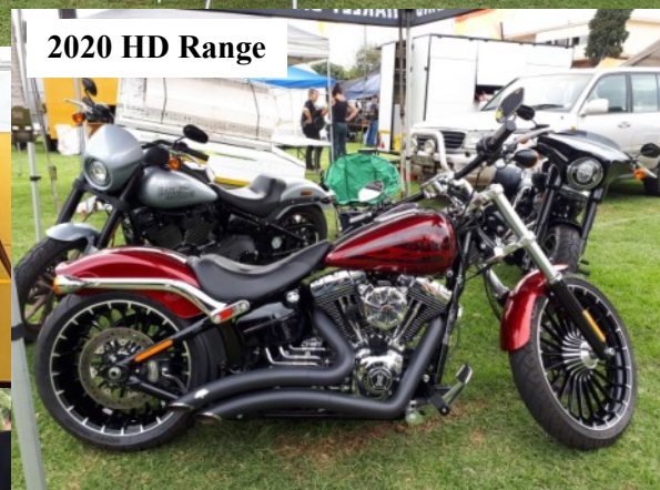
2020 HD Range