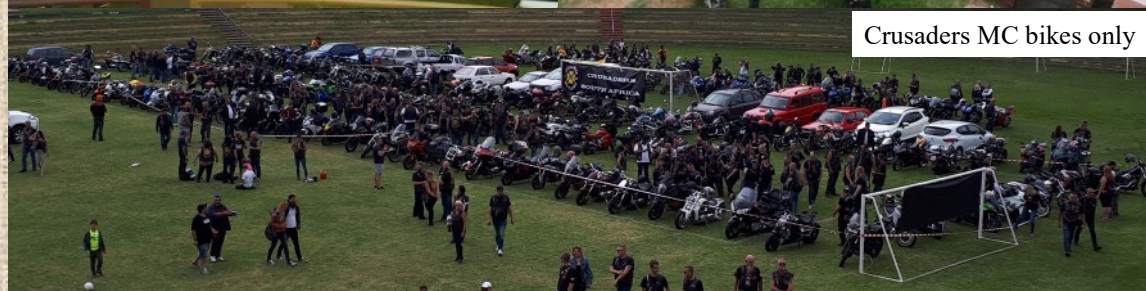
Crusaders MC bikes only